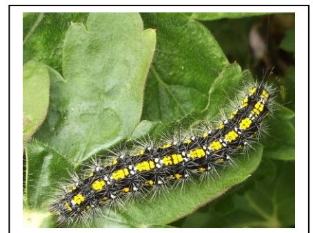
Scarlet Tiger larva by D Porter

Last year there were reports of Eyed Hawk-moth caterpillars near Faulkland. The Eyed Hawk-moth Smerinthus ocellata is well-named and flashes its intense blue 'eyes' when provoked. If it does not move, however, its camouflage ensures that it blends into the background. It is fairly well distributed in England and Wales. The caterpillars feed on sallow, apple and several other trees and the adults emerge in May. The adults, which have a wingspan of 70 – 80 mm, fly from May to July and you are most likely to see them in Woodlands or in suburban locations.