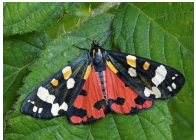
Scarlet Tiger moth

It is a white moth with a yellow tail, unlike its larva, that sports a multi-coloured warning livery – it must be handled with great care due to its irritating hairs, a feature it shares with many of the Lymantriidae. The larvae of both moths feed on a number of trees and shrubs.