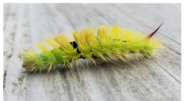
Pale tussock moth larva