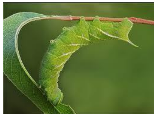
Eyed Hawk-moth caterpillar

Last year there were reports of Eyed Hawk-moth caterpillars near Faulkland. The Eyed Hawk-moth Smerinthus ocellata is well-named and flashes its intense blue 'eyes' when provoked. If it does not move, however, its camouflage ensures that it blends into the background. It is fairly well distributed in England and Wales. The caterpillars feed on sallow, apple and several other trees and the adults emerge in May. The adults, which have a wingspan of 70 – 80 mm, fly from May to July and you are most likely to see them in Woodlands or in suburban locations.