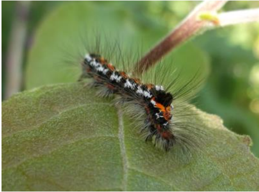
Yellow-tail moth larva on Sallow

Cinnabar and Mullein moth caterpillars often strip their food plants, Common Ragwort and Great Mullein, of foliage; Scarlet Tiger moth larvae, that commonly feeds on Comfrees and Hemp Agrimony, rarely does. All were reported this year from Radstock. The Cinnabar is an attractive Black-and-red day-flying moth that dipped in numbers here but is increasing again. The Mullein moth is a night-flyer.