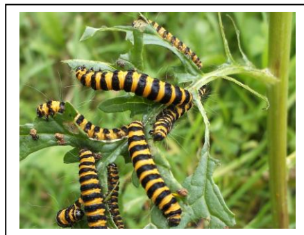
Cinnabar moth larvae on ragwort