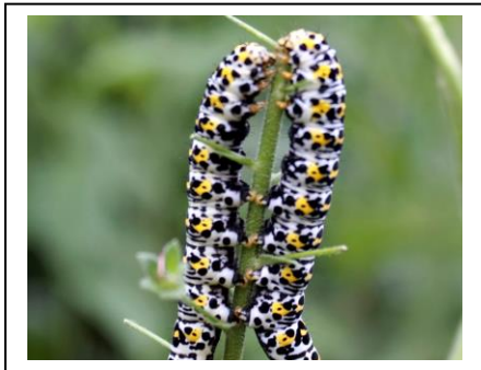
Mullein moth larvae

Cinnabar and Mullein moth caterpillars often strip their food plants, Common Ragwort and Great Mullein, of foliage; Scarlet Tiger moth larvae, that commonly feeds on Comfrees and Hemp Agrimony, rarely does. All were reported this year from Radstock. The Cinnabar is an attractive Black-and-red day-flying moth that dipped in numbers here but is increasing again. The Mullein moth is a night-flyer.