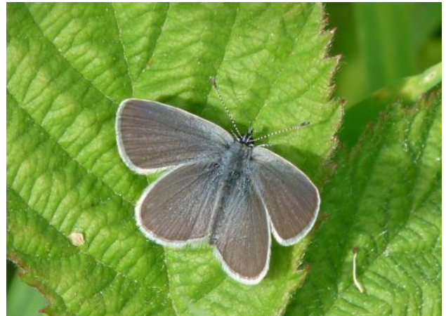
Small Blue by Phil Hall

Adult Hummingbird Hawk-moths, a Summer visitor, and Scarlet Tigers, a striking day-flying moth most obvious in the late afternoon/early evening, were seen in various places including Faulkland and Radstock.