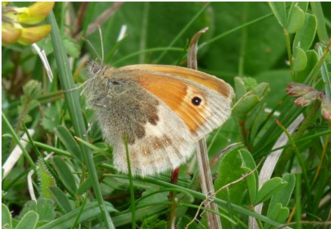
Small Heath

Several members have had the pleasure of seeing good populations of Small Heath, a UK Biodiversity Action Plan Priority Species, designated due to its decline in the UK, on Haydon Batch. This is thought to be the only location for this small butterfly in the Cam Valley Wildlife Group area. Haydon Batch is now owned by Radstock Town Council. It is very good news that there is a thriving population there and that it is not on a site that is threatened. The Small Blue has been recorded in our area for the first time in many years. Its larval food plant is Horseshoe Vetch.